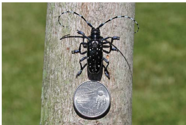
Asian longhorned beetle.

Adults emerge in late spring through late summer with peak emergence typically occurring in late June to early August; however, adults can be present in the fall. As adults chew their way out of the tree, they create large circular exit holes. Mating begins 2 to 3 days after emergence. ALB can overwinter in the egg, larval or pupal stage, but adults do not survive the winter, dying after the first fall freeze. There is one generation per year.