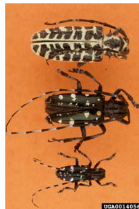
Cottonwood borer (top) with Asian longhorn beetle female (middle) and male (bottom). Female ALB are larger than males.

There are several insects native to the eastern U.S. that could be mistaken for ALB. Potential look-alikes include the cottonwood borer, the white-spotted sawyer and the eyed click beetle. The cottonwood borer and white-spotted sawyer are similar in size to ALB, but can be distinguished by solid black antennae (not banded) and different markings on the wings. The cottonwood borer has blocky white markings on the wings, while the white-spotted sawyer has mottled bronzy-black wings with white patches. The cottonwood borer and white-spotted sawyer larvae infest weakened and dying trees, and rarely affect healthy trees. The cottonwood borer infests the lower trunk and roots of poplar trees ( Populus spp.), with eastern cottonwood being the most preferred. The white-spotted sawyer infests pine tree species, including pines ( Pinus spp.), spruce