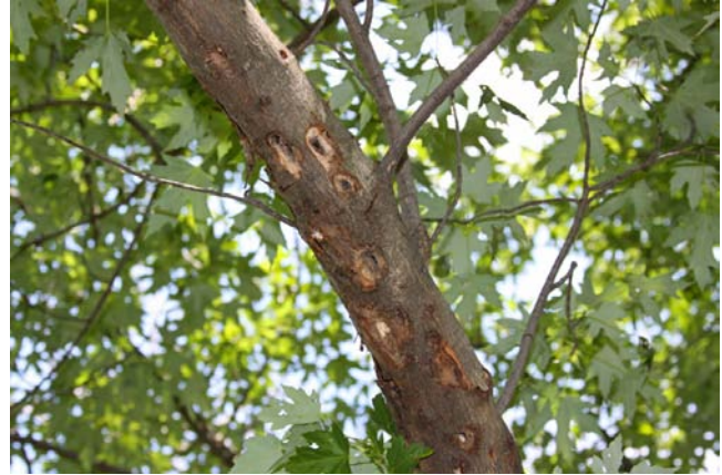
Woodpeckers create deep holes in the trunk and branches of infested trees as they excavate ALB larvae.