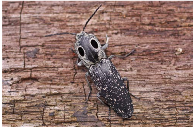
Eyed click beetle.