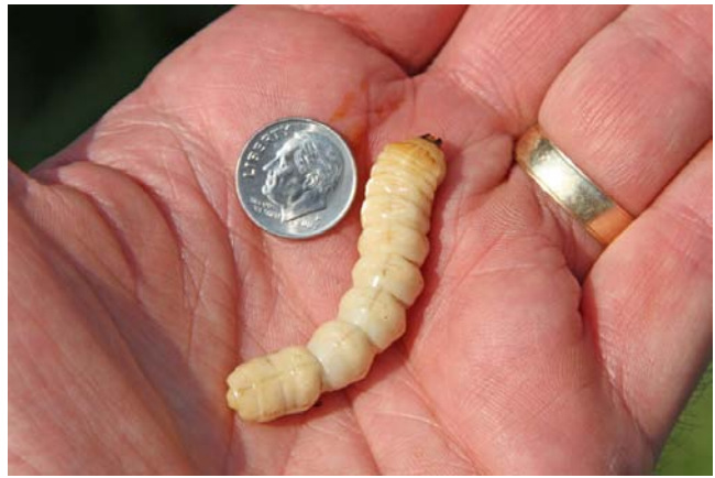
ALB larva.