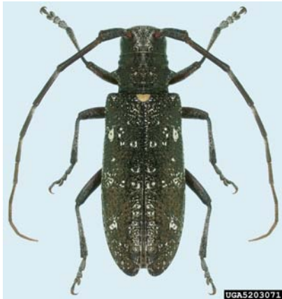
White-spotted sawyer.

Native cerambycid larvae are commonly found in dying or dead tree branches and trunks and are impossible to distinguish from ALB larvae. Roundheaded borers that are found in preferred ALB hosts such as maples should not be ignored, particularly if they are found in live trunks and branches; however, they should be identified by ALB experts.