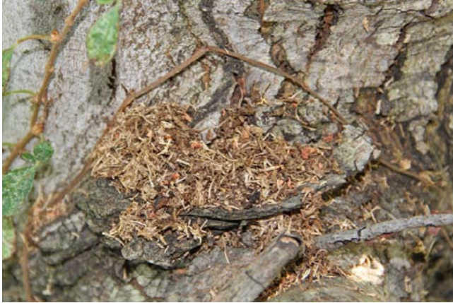
Sawdust present on the trunk, branches or base of the tree is a sign of adult or larval activity.