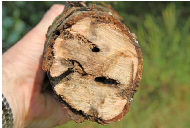
Larval tunnels or galleries can be found in broken branches of infested trees.