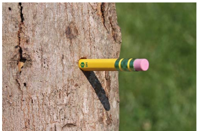
The pencil test. If a pencil can be inserted into an exit hole, it is a good indication that the hole was made by a cerambycid beetle because the larvae feed deep in the xylem.